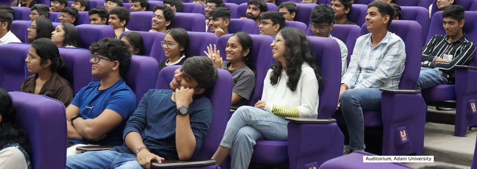
Auditorium, Adani University