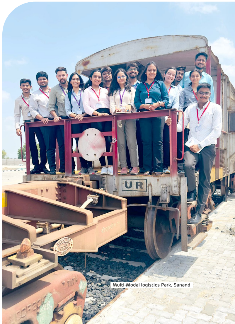
Multi-Modal logistics Park, Sanand