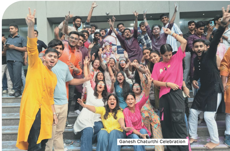
Ganesh Chaturthi Celebration