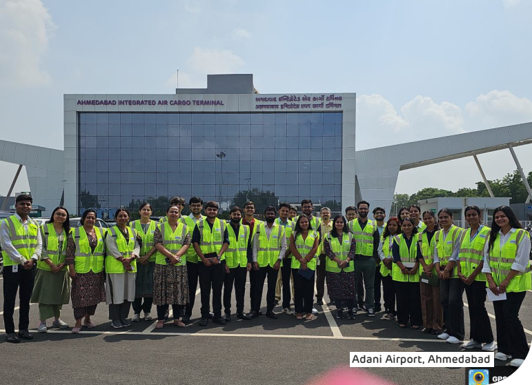
Adani Airport, Ahmedabad