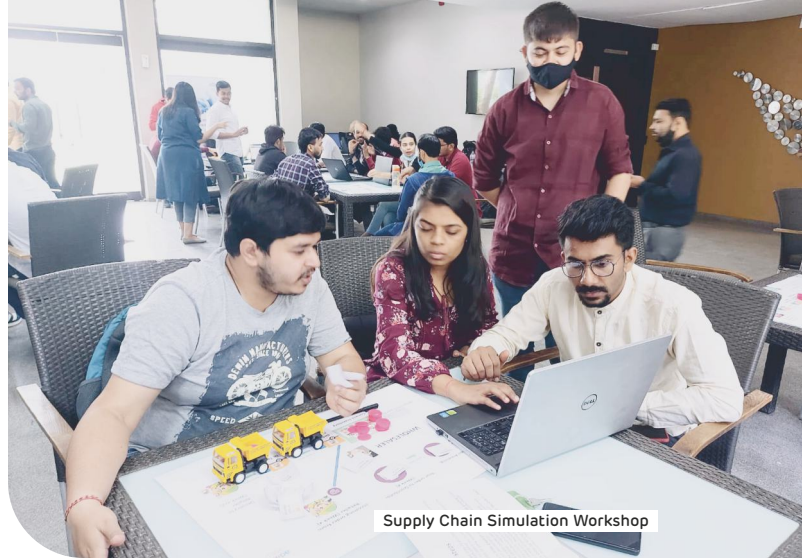
Supply Chain Simulation Workshop